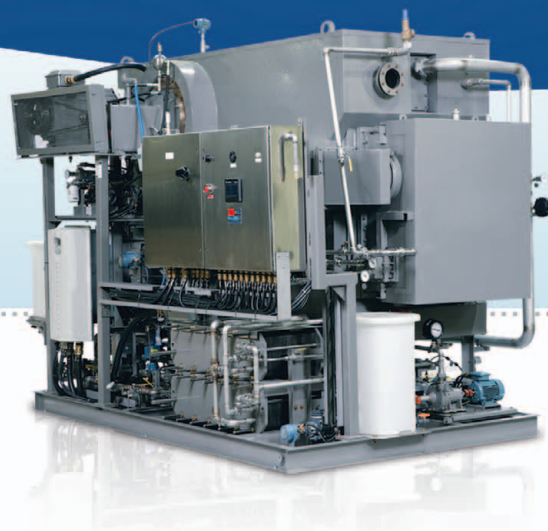
Model SV50 Vacuum Vapor Compression Distiller

1-800-964-7034 • 865-544-2065 • service@aqua-chem.com