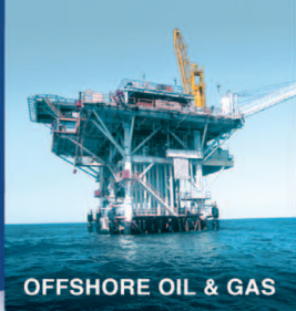
OFFSHORE OIL & GAS